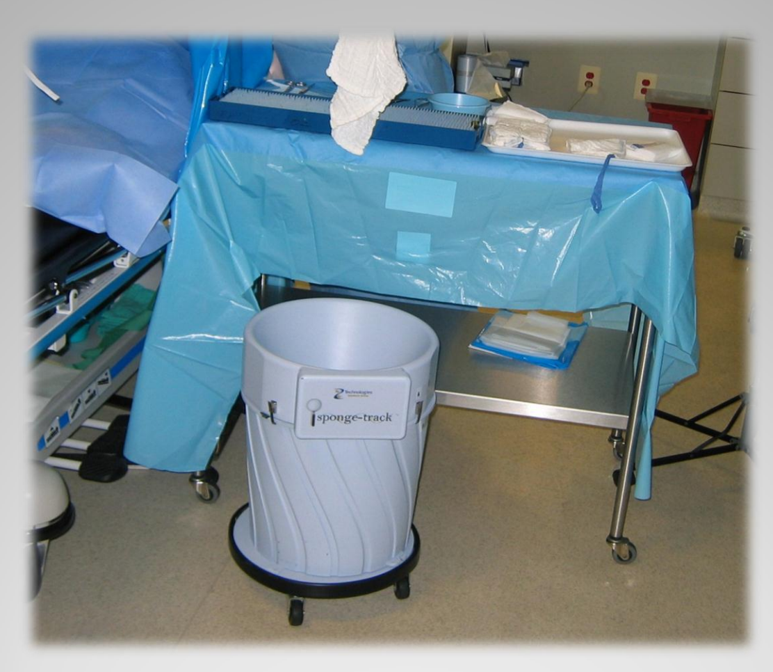
RFID Enabled Kick Bucket