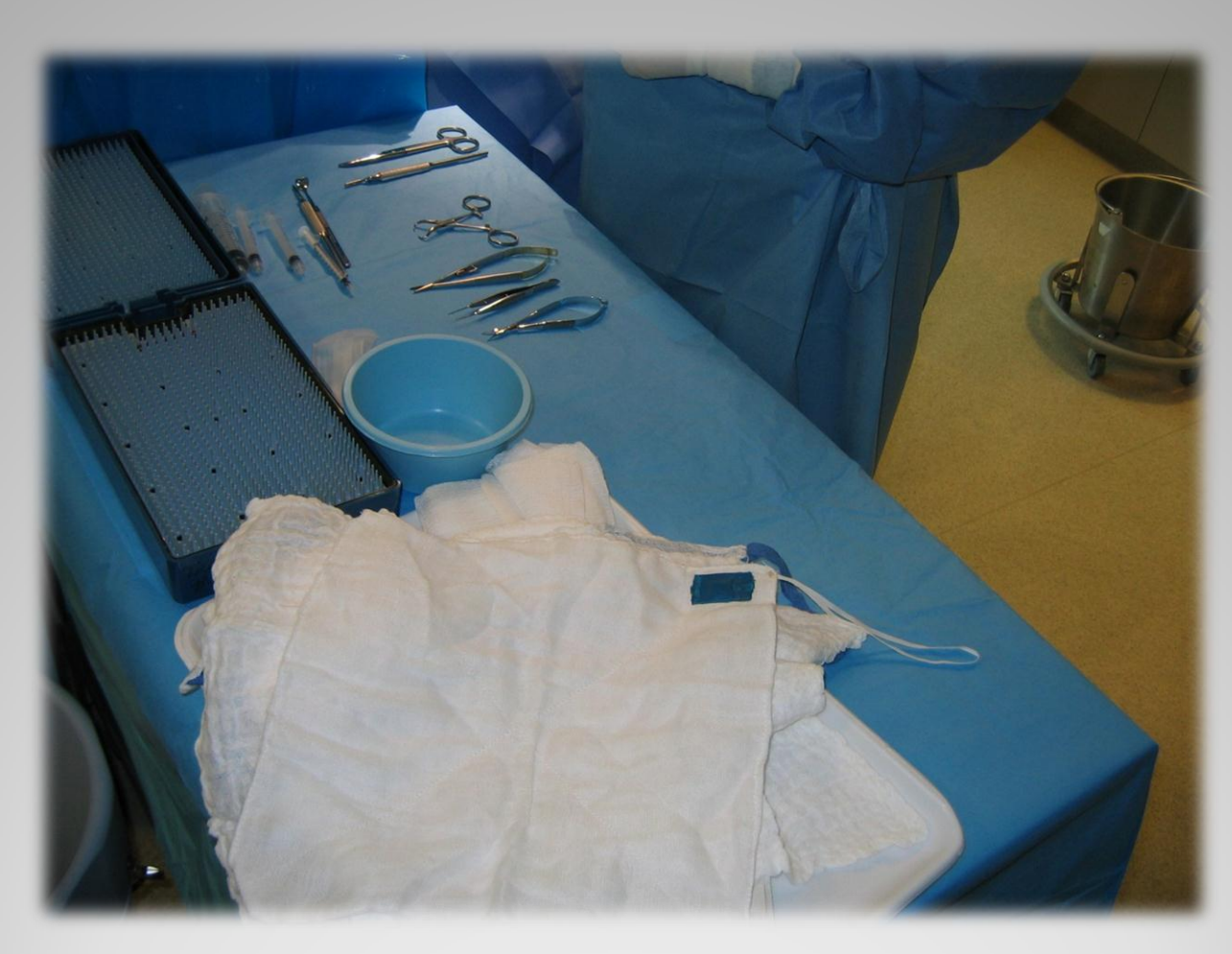
RFID Enabled Visi-Sponges